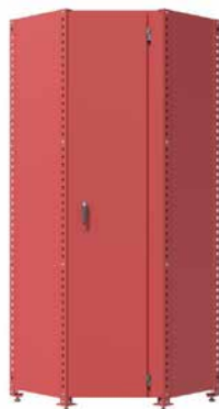
CORNER CABINET RSCCH800